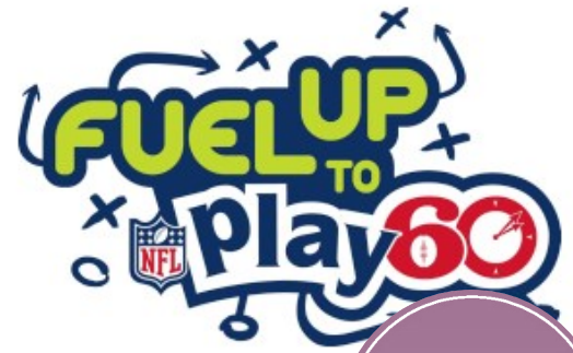
456 students positively impacted at 4 schools