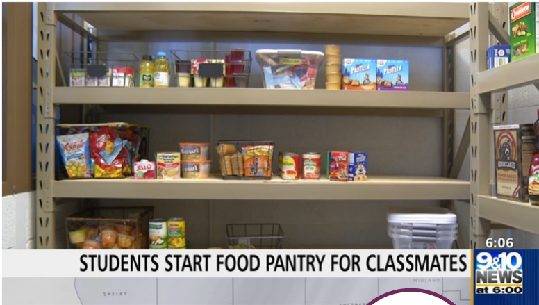
STUDENTS START FOOD PANTRY FOR CLASSMATES