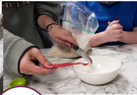
Teen Cuisine, Benzie Central