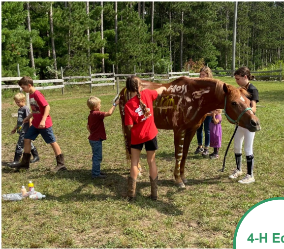
4-H Equine Day Camp

Learning Life Skills through Hands-on Experiences