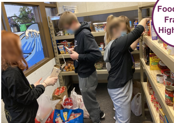
Food Pantry, Frankfort High School

“This program has helped me with my diabetes. I am eating better and eating more fresh food.”